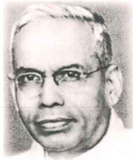
Dr. S.R. Ranganathan Former Madras University Librarian & Father of Library Science